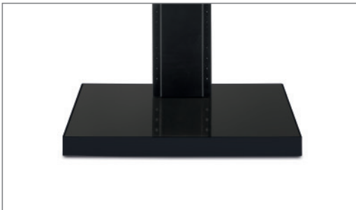
concealed castors, high-gloss surface